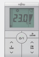
LCD Simple Controller without Operation mode* UTY-RHRYT